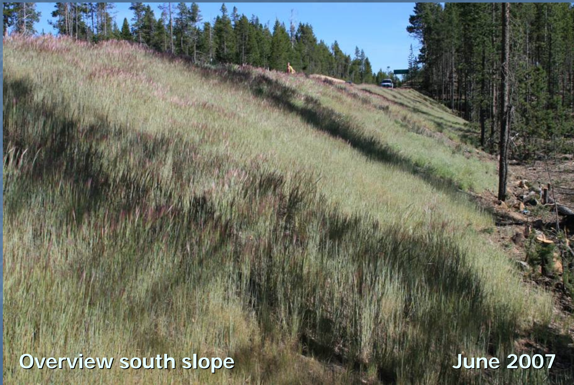
Overview south slope